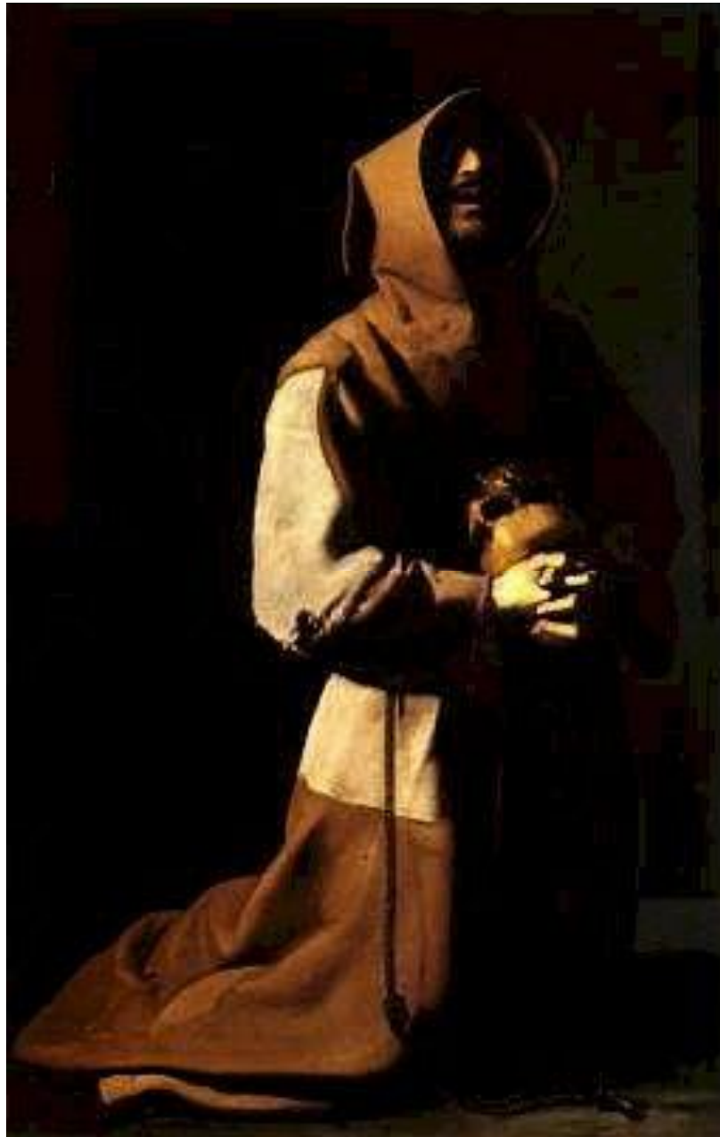
Fig 10. Francisco de Zurburán, Saint Francis in Meditation , 1635-40, oil on canvas, 152 x 99 cm. National Gallery, London.