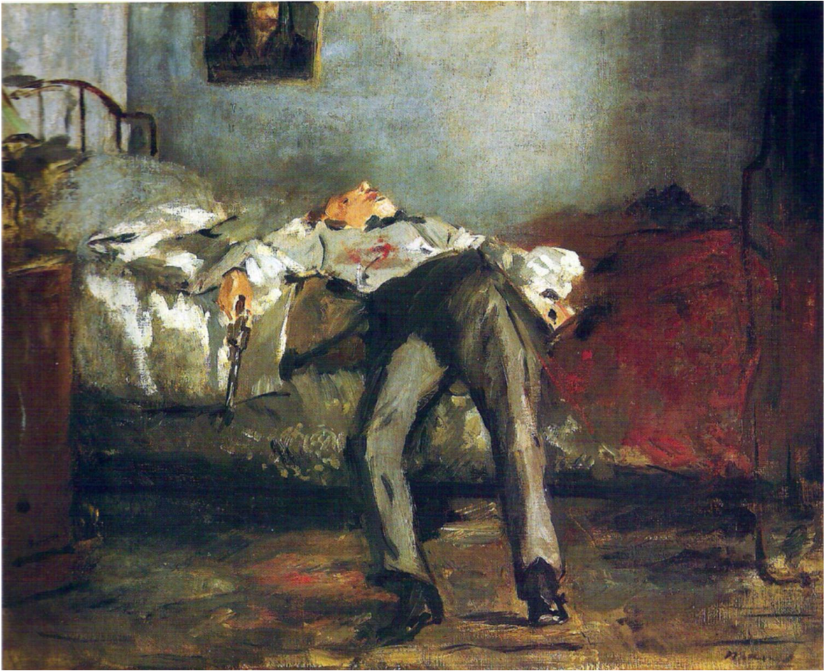
Fig 1. Édouard Manet, Le Suicidé , 1877-81, oil on canvas, 38 x 46 cm. Foundation E.G. Bührle Collection, Zurich.