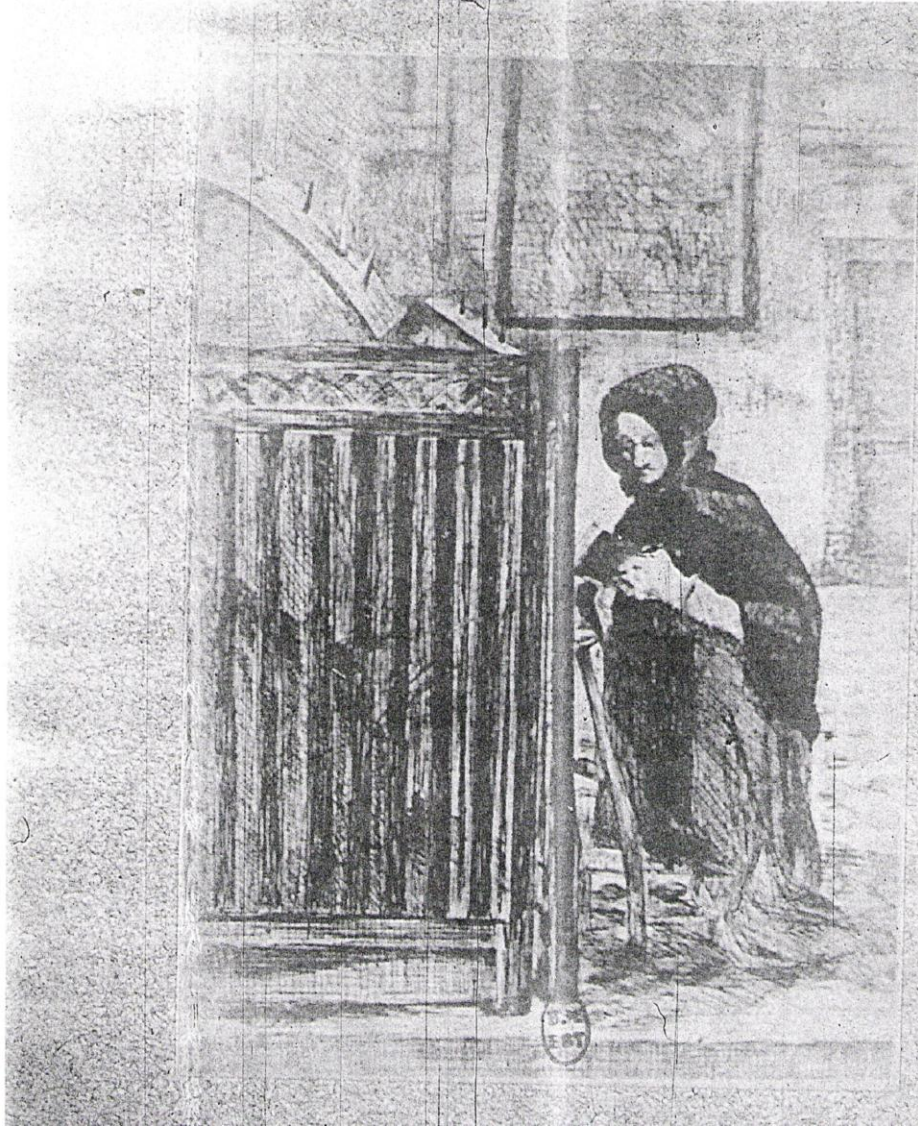
Fig. 9. Édouard Manet, In Prayer , 1861, engraving. Department of Prints and Photography, Bibliothèque Nationale, Paris.