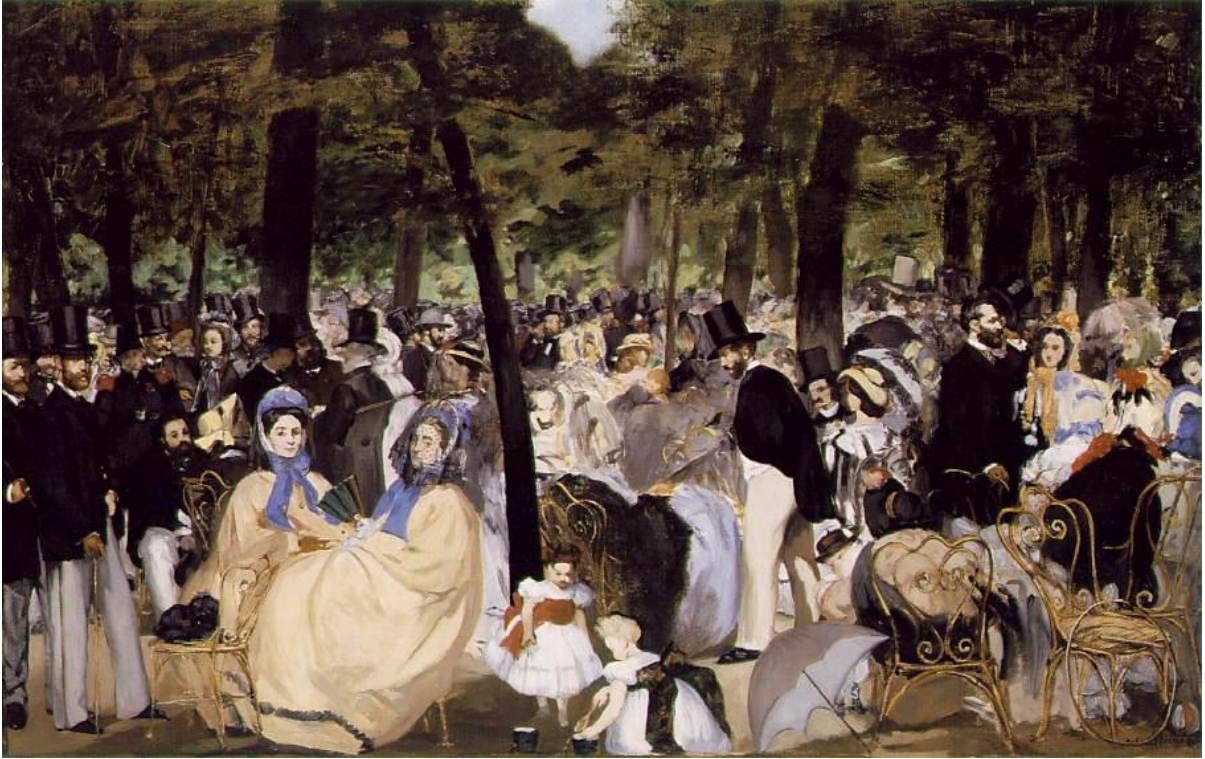
Fig. 5. Édouard Manet, Music in the Tuileries , 1862, oil on canvas, 76 x 118 cm. National Gallery, London