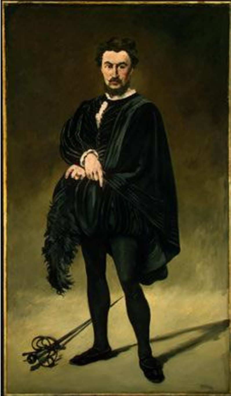
Fig. 2. Édouard Manet, The Tragic Actor , 1865-66, oil on canvas, 187.2 x 108.1 cm. National Gallery of Art, Washington, D.C.