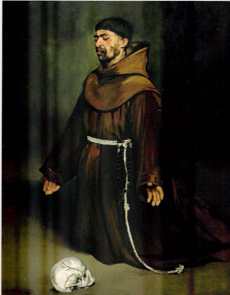
Fig. 8. Édouard Manet, Monk in Prayer , ca. 1864-65, oil on canvas, 146.4 x 115 cm. Museum of Fine Arts, Boston.