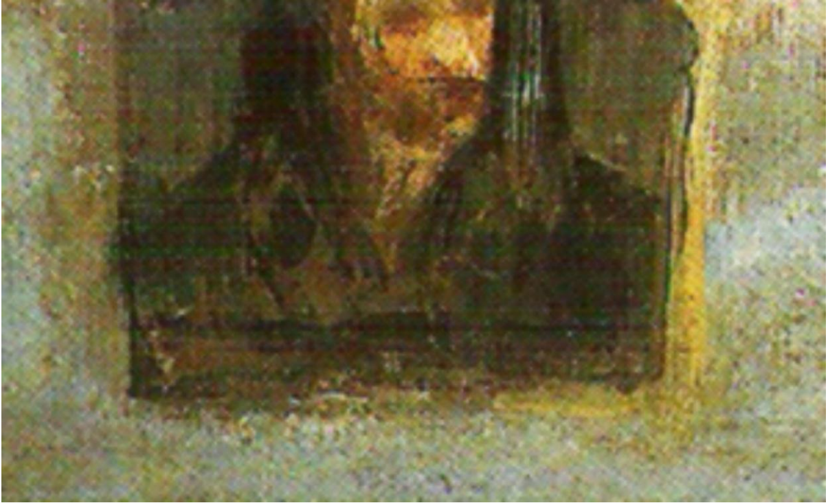
Fig. 7. Édouard Manet, Le Suicidé (detail), 1877-81, oil on canvas, 38 x 46 cm. Foundation E.G. Bührle Collection, Zurich.