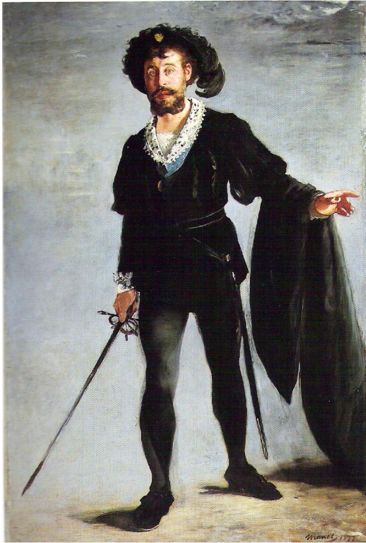
Fig. 3. Édouard Manet. Portrait of Faure in the Role of Hamlet , 1877, oil on canvas, 196 x 130 cm. Folkwang Museum. Essex.